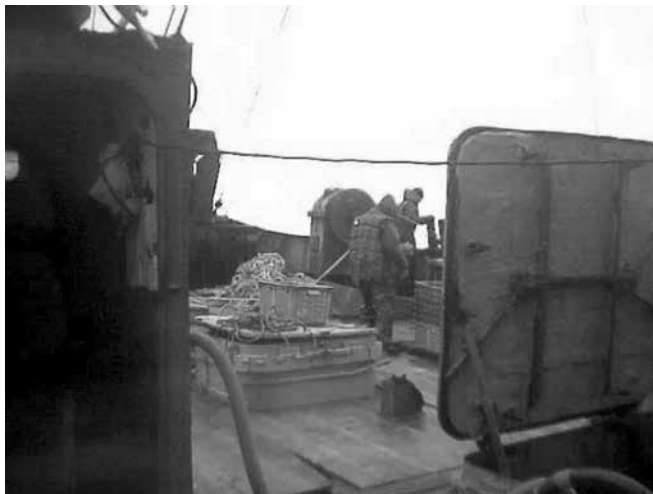
Photo: Ukrainian seafarer trafficked aboard an illegal crabbing vessel in Russia.

The crew began to complain about their health. One sailor had a splitting liver, the other [had problems] in the heart. Many had problems with their gums and teeth.