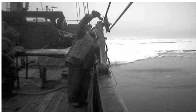
Photo: Ukrainian seafarer trafficked aboard an illegal crabbing vessel in Russia. Photo credit: Anonymous trafficked seafarer.

At sea they told us the conditions of the contract, which differed completely from the one we signed back in Ukraine... Slavery started literally from the very first day of arrival on board the vessel. The Russians were acting rather aggressively; they considered themselves as seniors as it was not their first experience. There were also some representatives of criminal groups, who were on the Russian federal wanted list. They fled to Japan and managed these two old clunkers from Japan. I cannot think of another word for these two ships than old clunkers. When we arrived and they told us about the new conditions I, as the eldest and more experienced, asked a question: “How can we get home?” We had completely different contract conditions and, since the contract conditions were violated, we were not about to work there. I was told that if we wanted there was a boat that could come and take us from the ship and take us home for 2000USD. Certainly no seafarer had more than 100 or 200USD with him. That is why we had to agree to stay for the minimum period of time that they offered us.