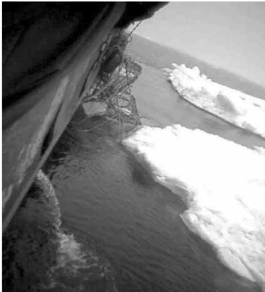
Photo: Dilapidated illegal crabbing vessel in Russia onto which Ukrainian seafarers were trafficked for fishing.

We were taken on a boat to go to sea and embarked on a ship that did not have any sign and name on it... When the boat went, we were told by those who were on board that they were working 24 hours a day, almost without sleep, no money paid and also that it was impossible to leave since the ship never entered port.