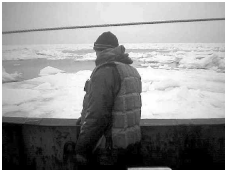
Photo: Ukrainian seafarer trafficked to Russia for illegal crabbing.