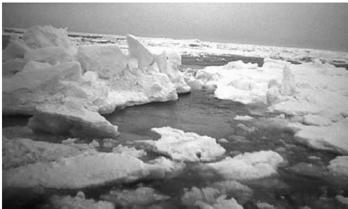
Photo: An ice flow, taken from the vessel on which Ukrainian seafarers were trafficked for illegal crabbing in Russia.

My speciality, I am a cook... I used to order the products myself for the two ships that I recently worked on. I could choose the products. The situation was different. Whereas when we were in slavery, they were bringing us junk and, moreover, it was only half of what was needed. There was no water at all. We used to put some seafarers down on an ice flow; we'd put a hose and pump water to drink.