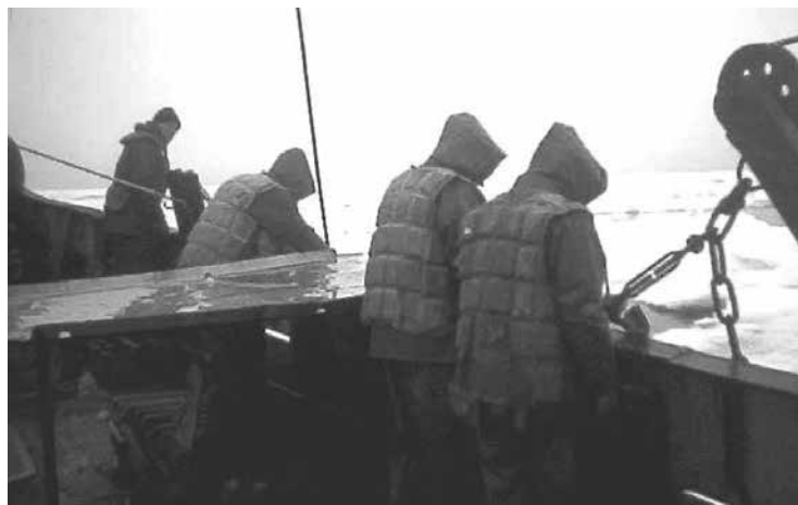
Photo: Ukrainian seafarer trafficked aboard an illegal crabbing vessel in Russia.

from one crab trap to another. It would be about 15 minutes or half an hour, people would just fall down in the corridor dressed, dirty and not washed. I would ask them: “Will you eat?” And they would reply: “No, no, let us have a short nap because we will go to work again and will not have time to rest”. 40