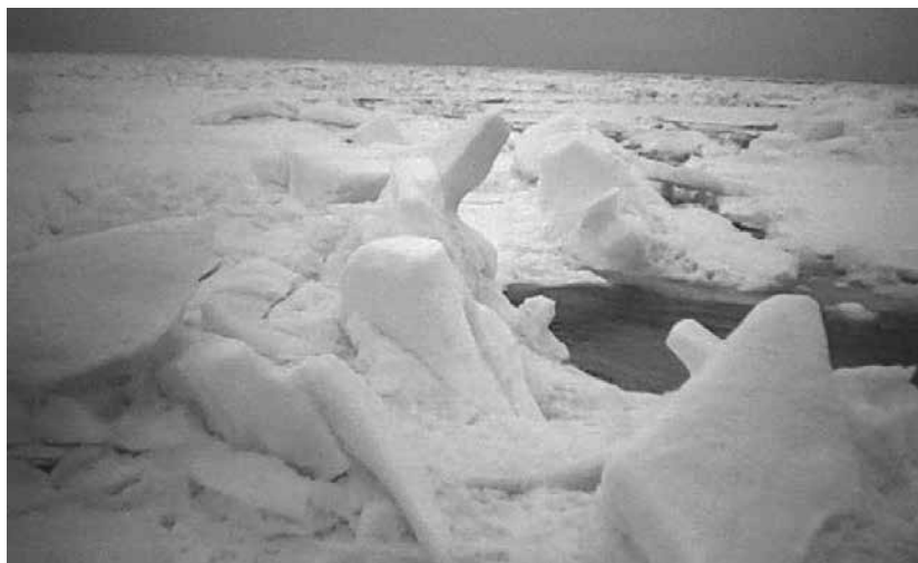
Photo: View of sea and ice flows from illegal crabbing vessel in Russia; trafficked Ukrainian seafarers aboard. Photo credit: Anonymous trafficked seafarer.

One of the key challenges in the fight to end trafficking is the identification of trafficked persons. “Identification” means coming into contact with trafficked persons in ways that can facilitate their escape from exploitation and give them access to post-trafficking protection and assistance. Identification is difficult because so much trafficking takes place “out of sight”, with traffickers consciously and strategically limiting contact between trafficked persons and others, particularly individuals and organisations that might be able to help them. Other obstacles to identification include language barriers and corruption.