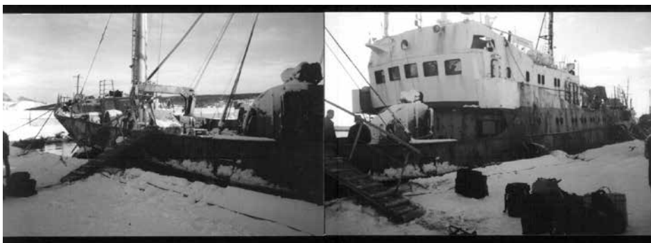
Photo: Russian vessels on which Ukrainian seafarers were trafficked for illegal crabbing.