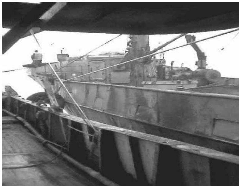
Photo: One of the vessels on which Ukrainian seafarers were trafficked in Russia. Photo credit: Anonymous trafficked seafarer.

necessary formalities and then they let us pass through customs. We were placed on a very old boat and this agent left without saying a word. On this boat we went to the Pacific. We travelled for about twelve hours.